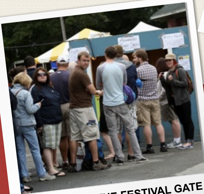
CROWDS AT THE FESTIVAL GATE